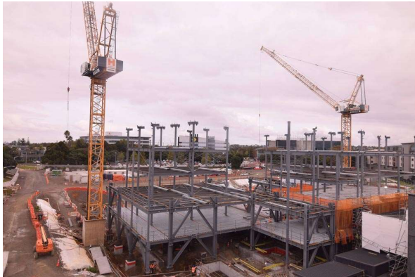
Full aerial site photo taken on April 12 shows the main steel structure going up