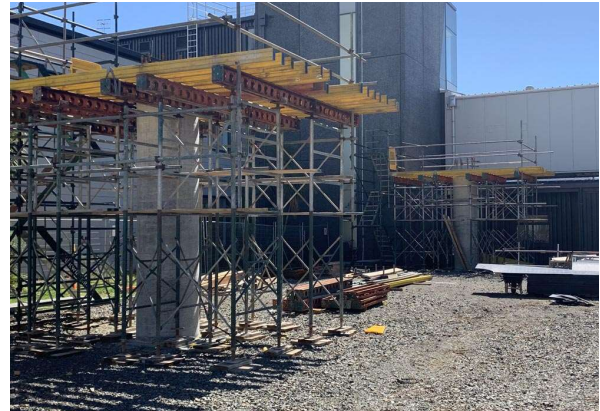
Columns supporting the steel structure for the extension of the Sky Bridge which will run from the Elective Surgery Centre through to Tōtara Haumaru